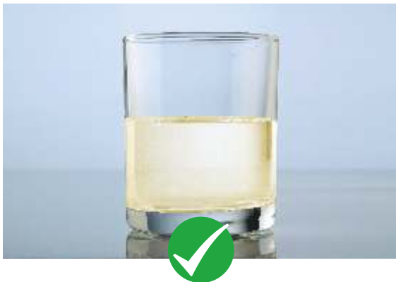
Pure wheat flour