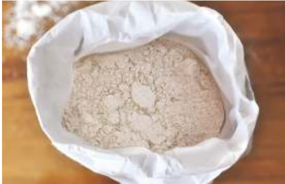
Atta, Maida, Suji (Rawa)